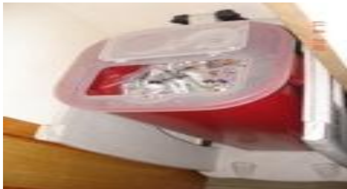
Full Sharp Container at St. Jude Hospital 17.08.12

At the St. Jude Hospital, we observed sharps collection containers filled above the recommended three-quarters level. This can result in an increased risk of needle sticks that can negatively affect the safety and health of waste handlers.