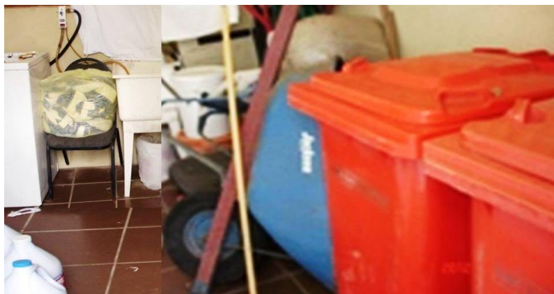
Waste Stored in Laundry Room, Gros-Islet Poly Clinic

At the Gros Islet Polyclinic, we observed that biomedical waste was stored in the laundry room. This practice increases the risk of exposure to persons who frequent the room for laundry and other maintenance activities. Staff complained of the unpleasant odour resulting from the weekly storage of this waste.