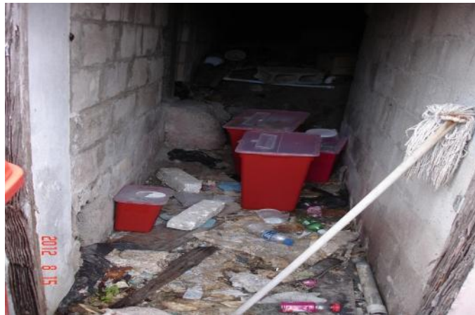
Sharp Containers Stored in an Open Wall Cavity –Victoria Hospital