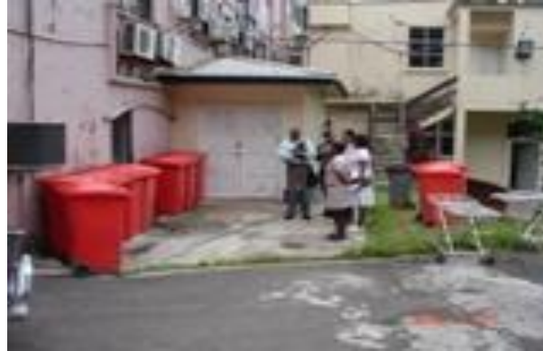
Open Storage at Victoria Hospital